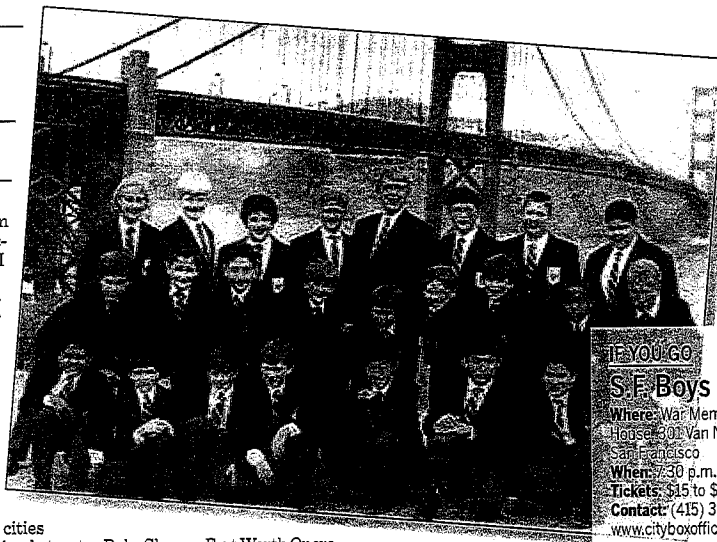
The San Francisco Boys Chorus celebrates six decades with a gala concert Sunday at the War Memorial Opera House.